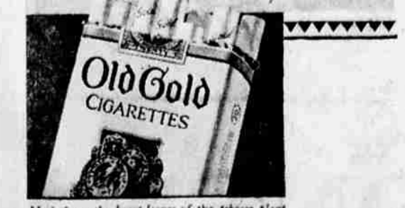
Made from the heart-leaves of the tobacco plant

SMOOTHER AND BETTER—"NOT A COUGH IN A CARLOAD"