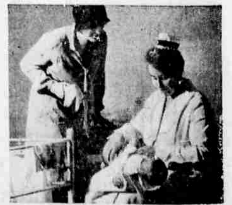
Lever Bros. Co., Cambridge, Mass.

LUX IS SO PURE that the famous New York Maternity Center uses Lux in cleansing all baby things, so that there can be no risk of irritating the baby's tender skin. This gives vivid proof of the purity of Lux and the great care with which it is made. For organizations such as the Maternity Center have submitted Lux to most rigid analysis and tests before choosing it officially. No wonder Lux never harms delicate colors or fine fabrics.