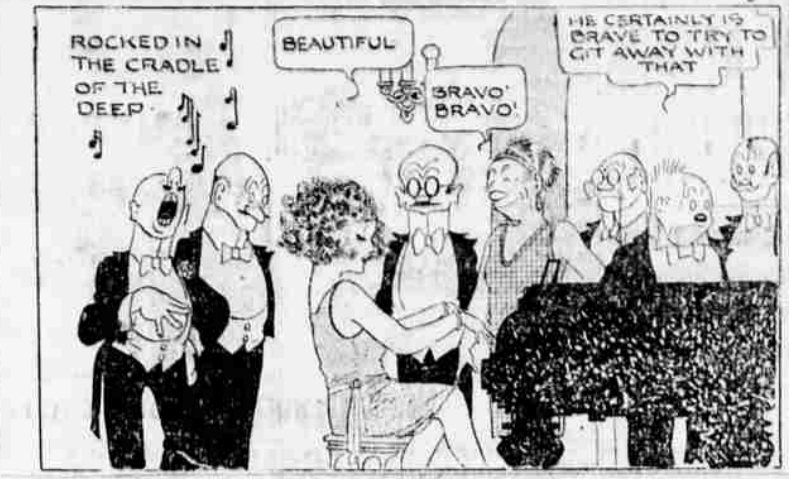
THE NEBBS—Drifting Apart