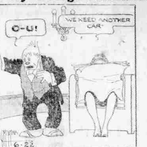
By SOL HESS