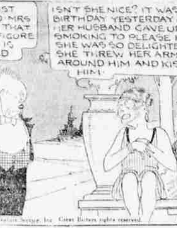
THE NEBBS—You Jealous Boy