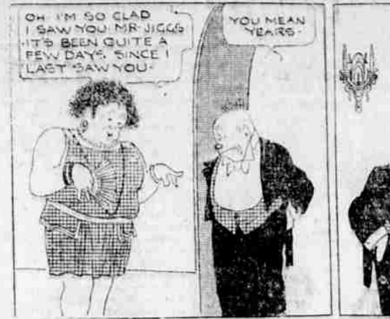
THE NEBBS—You Jealous Boy