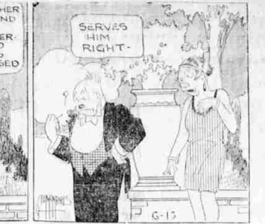
By SOL HESS