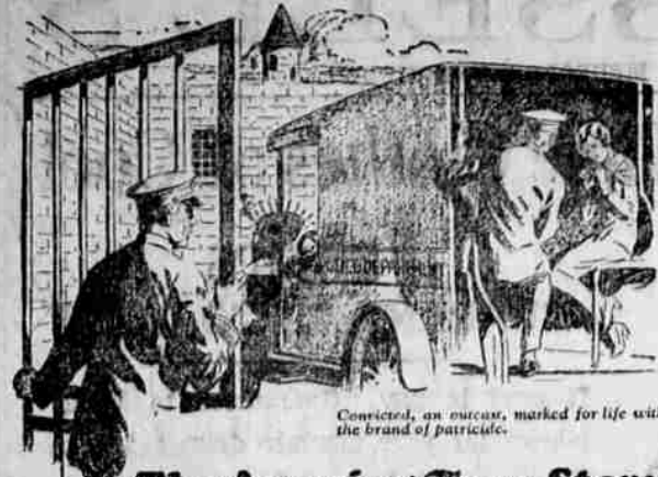
Convicted, an outcast, marked for life with the brand of patricide.