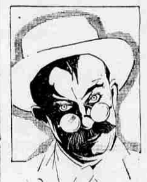
CHESTER CONKLIN IN "FOOLS FOR LUCK"

"Fools for Luck," a comedy, opened at the Rialto theater this afternoon. Sparkling, humorous situations, worked through a logical and highly interesting story spiced with an appealing love theme, make this picture refreshingly different from the ordinary run of screen comedies. Fields and Conklin have given the public many laughs in their long careers as comedians, but they have never before had roles which fit them as do their parts in "Fools for Luck." Fields, as the glib promoter who invades the small town with a grip full of oil stock and his pockets empty, is a riot of fun. His characterization is so convincing that one feels sorry for the public should he ever tire of the screen and decide to take up promoting as a career. Conklin is perfect as the leading citizen of the small town who loves his wife, is proud of his beautiful daughter, and almost as proud of his reputation as pool champion of the municipality. There are touches of pathos in the warring mustached comedian's characterization that are truly masterful. Treasure Hunters. POTSDAM—Gold diggers are on the city beach near here. Every year, shortly before the season opens, hundreds of youths spade up the sand, hunting rings, coins and trinkets lost or washed ashore since the year before.