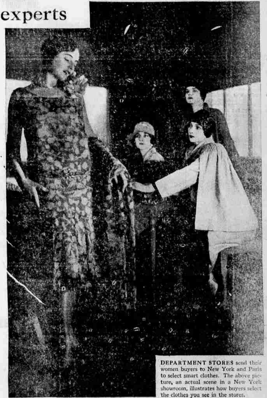
DEPARTMENT STORES send their women buyers to New York and Paris to select smart clothes. The above picture, an actual scene in a New York showroom, illustrates how buyers select the clothes you see in the stores.

Like women everywhere, the women who buy for America's great stores—buy the charming clothes that the women of America wear—overwhelmingly insist upon safe cleansing with Lux!