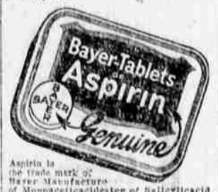
Aspirin is the trade mark of Bayer Manufacturing of Monacochester of Ballegoedts

There is nothing quite like Bayer Aspirin for all sorts of aches and pains, but be sure it's genuine Bayer; that name must be on the package, and on every tablet. Bayer is genuine, and the word genuine—in red—is on every box. You can't go wrong if you will just look at the box when you buy it.