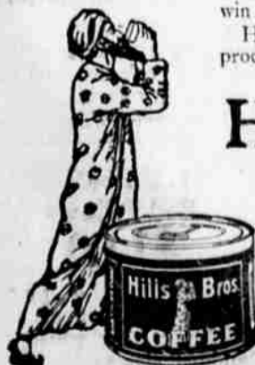
Fresh from the original vacuum pack. Easily opened with a key.