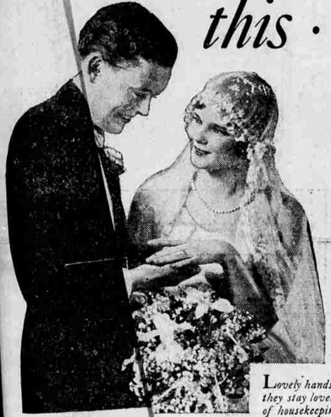
Lovely hands... will they stay lovely, in spite of housekeeping cares?

A WHOLE "crop" of new brides—in 11 cities—more than 1,200 of them—told us their home-making. Each plan was different of course. But on one thing these brides were agreed. They are going to do up housekeeping as a job which requires intelligence and skill. Yet one to be filled without sacrifice and GOOD-LOOKS. And 96 out of 100 brides have decided on one way to do this—because they know their own fine things—how soft Lux to wash their hands, they plan to use soft Lux makes their cleaning their hands happy for all DISHES, all