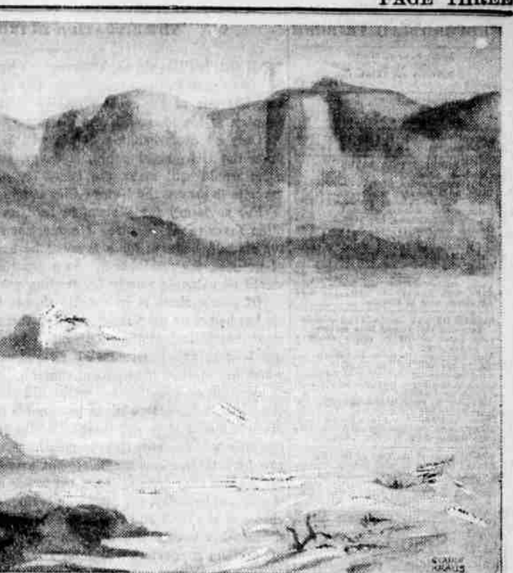
"the best oil we have ever used"

Your automobile club or any touring bureau will tell you where they are. And if the going is tough—don't let that worry you—use Castorlube—it makes it easier and won't overheat.