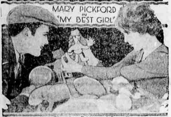
MARY PICKFORD "MY BEST GIRL"