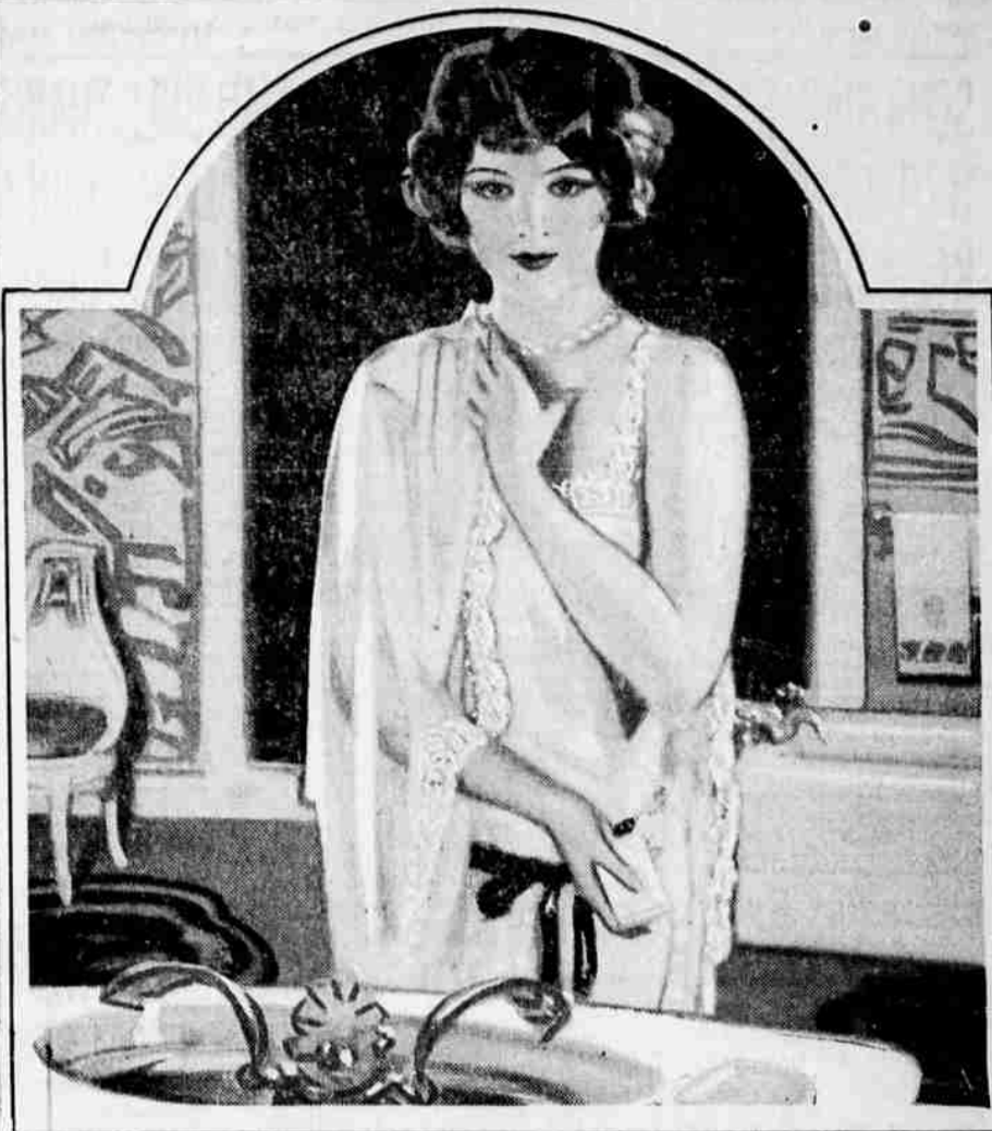
Myrna Loy, Warner Bros. Star, and the luxurious bathroom designed for her rare, auburn-haired beauty!

STANDARD OIL COMPANY OF CALIFORNIA. Windows and Doors. LARGEST STOCK IN SOUTHERN OREGON. TROWBRIDGE LUMBER YARD.