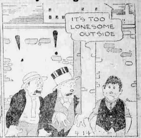
MUTT AND JEFF—Isn't Mutt's Son a Sweet Little Thing?