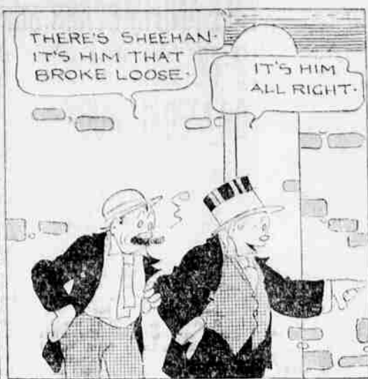
MUTT AND JEFF—Isn't Mutt's Son a Sweet Little Thing?