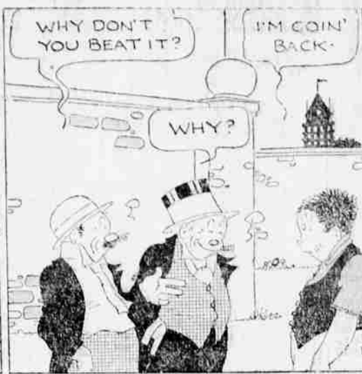
MUTT AND JEFF—Isn't Mutt's Son a Sweet Little Thing?