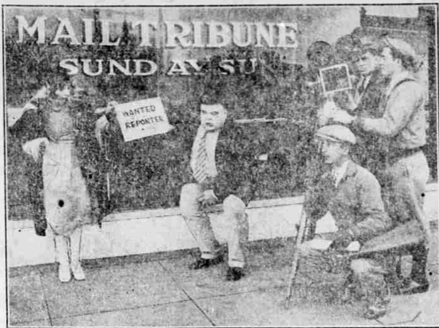
A scene from "The Reporter," showing company in action in front of Mail Tribune office.

The finishing touches and editing were put on "The Reporter," a "home grown" Medford movie, at 3 o'clock this morning in preparation for its initial showing at the Riako theatre today, tomorrow and Wednesday. It is an unusually interesting picture of life in this city and has in its cast many local people who will be astonished at their own acting ability when they see themselves on the celluloid this evening. According to the interesting scenario, worked out for the screen by the H. L. L. company, Fatty arrived here from San Francisco by airplane, his plane landing on Harbor field, to answer an advertisement in the Mail Tribune for a reporter. He immediately rushed to the Tribune office, where he finds a crowd of applicants, eager for the position. After struggling through the gathering he gets to the front door and secures the job