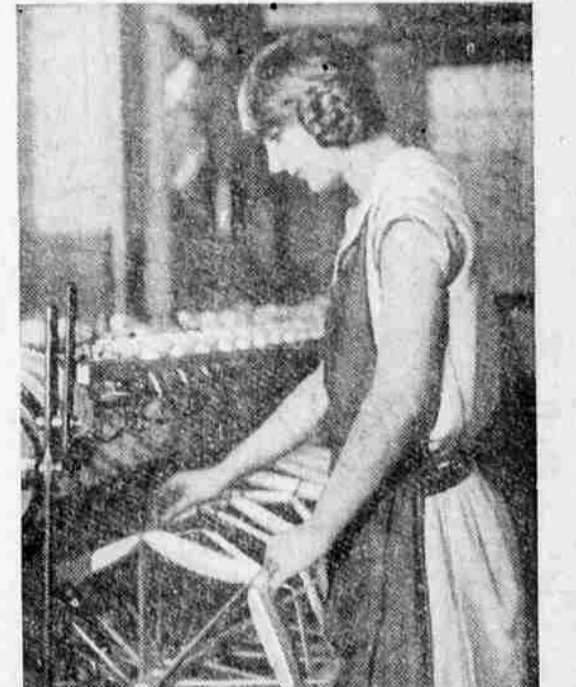
One of the workers in the Straus Silk Mills. 3/4 of these workers said that after a long day on their feet they find Sloan's their best help for tired backs and legs.

ONLY the mill workers themselves know how legs and feet can ache and how lame backs can be after a long day walking up and down a spinning frame. Something they must have to take the ache out—to relieve the stiffness and fatigue which might otherwise make it necessary for them to miss many a day's work. The workers in the Straus Silk Mills in Trenton are a particularly fresh, wholesome-looking lot of women. And so we asked them what they do to prevent aching and strain from standing at a spinning frame all day. From three-quarters of them came promptly the answer, "I never use anything but Sloan's."