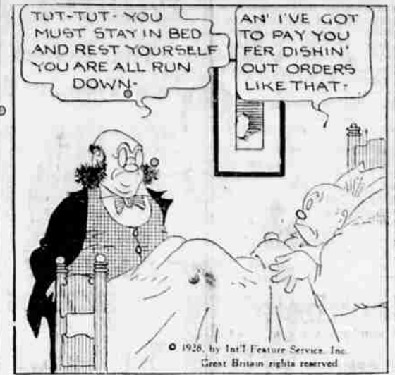
MUTT AND JEFF—Jeff Has His Own Idea on Nautical Etiquette