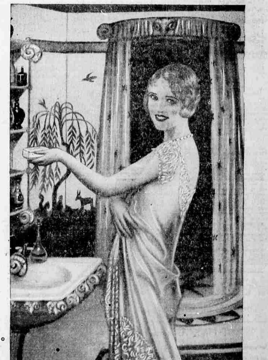
PHYLLIS HAVER and the striking bathroom inspired by this popular Pathé De Mille star, Nine out of ten screen stars use Lux Toilet Soap

You too, like the radiant stars whose exquisite skin is admired by millions, will love the caressing, instant lather of this delicately fragrant, white cake. Even hard water can't quell its bubbling lather! Order some Lux Toilet Soap today—enjoy the luxury that until now you only found in French soaps at 50c or $1.00 a cake—now it's just ten cents! Lever Bros. Co., Cambridge, Massachusetts.