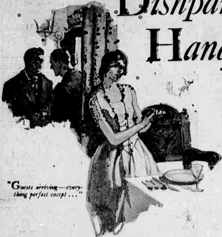
"Guests arriving—everything perfect except..."

M Y dinner table, set with all my best china for our dinner to Jim's new friends, had never looked prettier. But it made my poor hands look dreadfully coarse by comparison. They simply broadcasted 'Dishpan'!