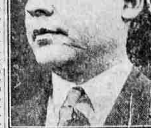
Abelardo Rodriguez, governor of Lower California, under whose regime a new scheme of road-building and general development is being planned for West Mexico.