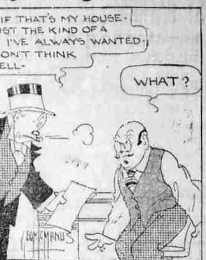
Copyright 1928, by H. C. Fisher. Great Britain Rights Reserved. Trade Mark Reg. U. S. Pat. Office.