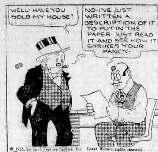
1928, by Nat'l Feature Service Inc. Great Britain rights reserved.