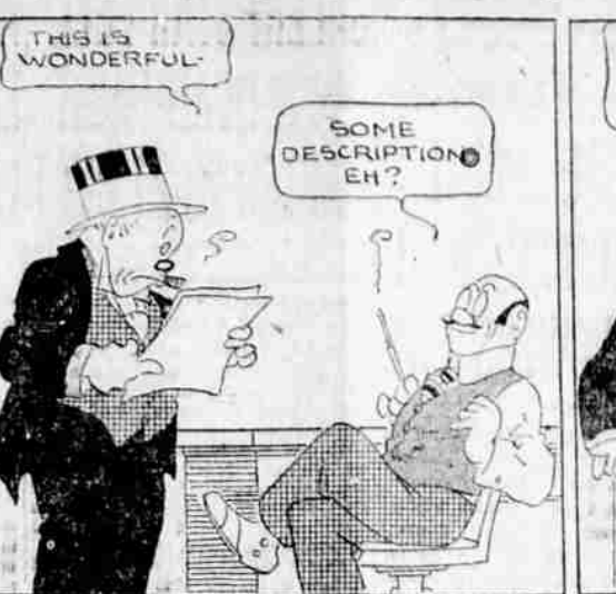
Copyright 1928, by H. C. Fisher. Great Britain Rights Reserved. Trade Mark Reg. U. S. Pat. Office.