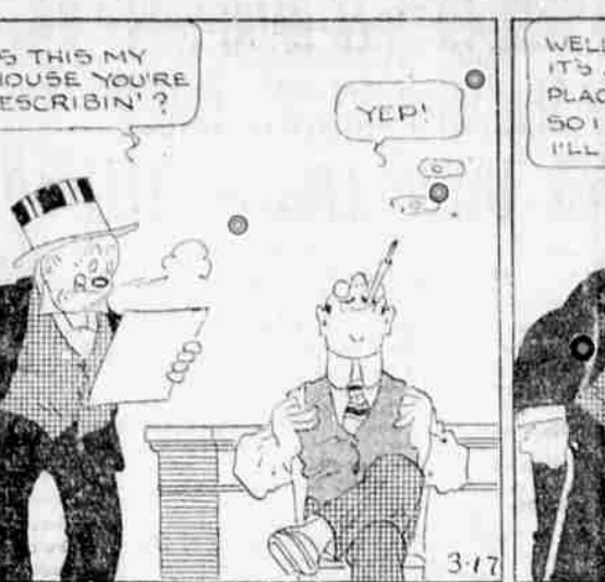
Great Britain Rights Reserved. Trade Mark Reg. U. S. Pat. Office.