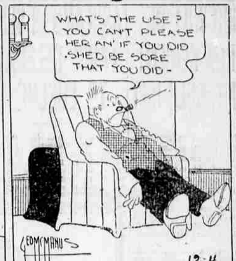
© 1925 by INT'L FEATURE SERVICE, INC. Great Britain rights reserved.