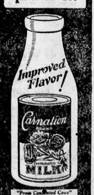
"From Condensed Cows"