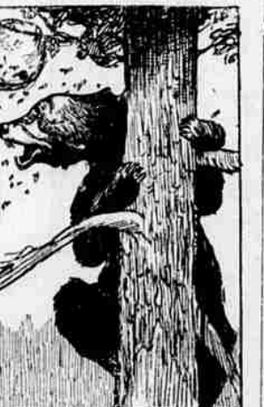
The Bees Swarmed Out of Their Front Door.

"It's no laughing matter, Two-Legs. I wish your nose itched like mine does; then you would sympathize with, not laugh at me!" Peter