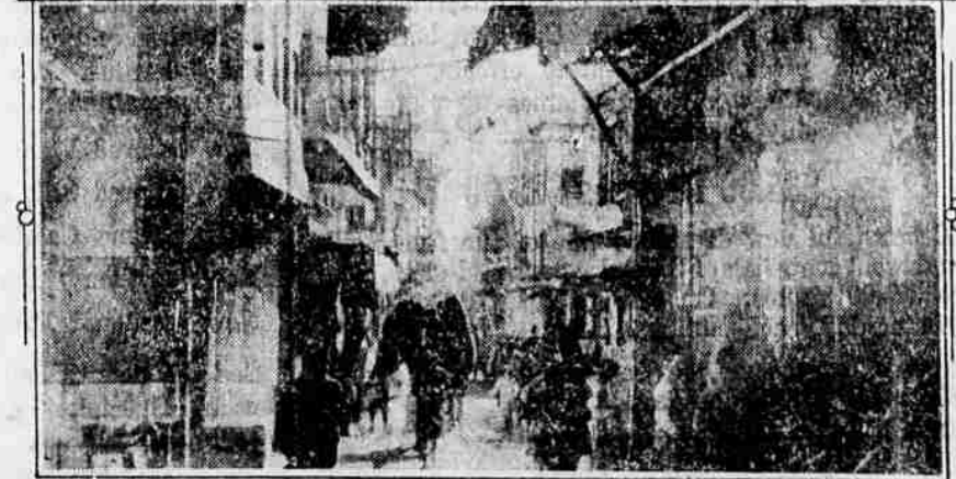
Later pictures from Damascus give a more graphic idea of damage inflicted on city by French bombardment, now being called greatest setback given European prestige in the East since British attacks on natives in India. Photos show famous "Street Called Straight" in Damascus before and after the shelling, which continued for two days and killed hundreds of native men, women and children.