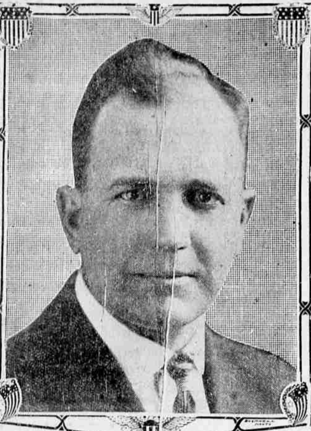
United States Senator Stanfield.

The Craters have extended an invitation to Senator Robert N. Stanfield to address their meeting Tuesday evening at the Hotel Medford. Because of the fact that Mr. Stanfield's subject, "Conservation Without Confiscation," which covers the Oregon and California land grant situation, is of vital importance and interest to everybody in southern Oregon, they have extended a cordial invitation to all Medford service organizations and the general public to participate in a Crater eruption and enjoy a Turkey dinner and his talk. This meeting should be one of the best which has been held for many months. The well-known Craters' eight-piece symphonic orchestra will present several of the latest music hits, and there will be other numbers on the program which will round out a big evening. Mr. Stanfield's address, however, will be the big feature.