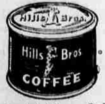
In the original Vacuum Pack which keeps the coffee fresh.