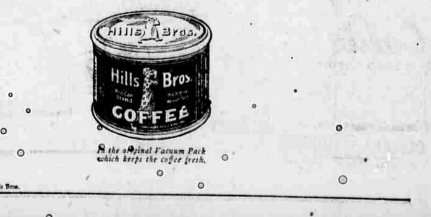
The original Vacuum Pack which keeps the coffee fresh.