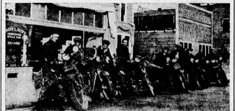
These Boys Have Pledged Themselves to Make Motoring Safe.