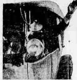
An operator intending to turn his vehicle to the right shall extend his arm with his forearm raised at right angles, for a reasonable length of time.