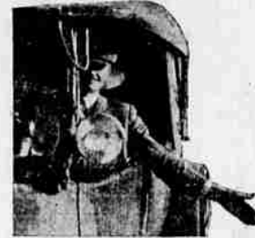
When intending to stop extend arm and move up and down in vertical direction for a reasonable length of time.