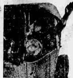
An operator intending to turn his vehicle to the right shall extend his arm with his forearm raised at right angles, for a reasonable length of time.