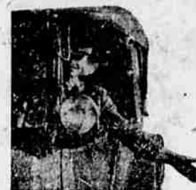
When intending to stop extend arm and move up and down in vertical direction for a reasonable length of time.