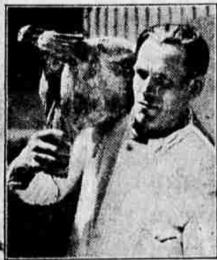
Makes remarkable recovery from bad sprain

Mr. Hull and Representative Oldfield of Arkansas, chairman of the democratic congressional committee, will present a resolution to the house asking that the ways and means committee be empowered to draft a tariff bill. Neither Mr. Hull or Oldfield has outlined a definite plan for revision. Chairman Green of the committee said today he would oppose any revision of the act, believing it would be unwise to "tinker at all with the tariff" unless it were gone over thoroughly.