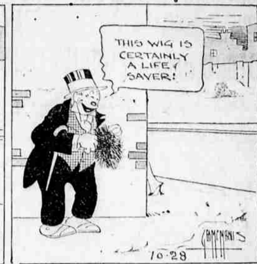
© 1925 BY INT'L FEATURE SERVICE, INC. Great Britain rights reserved