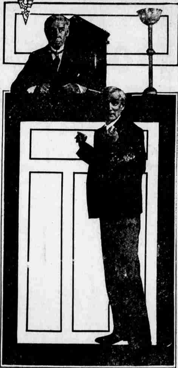
A COURT SCENE

An event of interest to theatergoers will be the engagement tonight at the Hunt's Craterian theater of the widely heralded comedy hit, "Lightning."