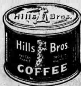
In the original Vacuum Pack which keeps the coffee fresh.

Attention, W. O. W. Medford Camp, No. 90, Woodmen World, will hold a big meeting Friday evening, Sept. 11th. All members are urged to attend. There will be entertainment and refreshments.