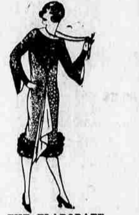
THE ELABORATE AFTERNOON FROCKS SHOW RICH PATTERNS AND FUR TRIMMED FLARES

The new September shipment of "Irene Castle" Dresses now on display — wonderful creations, moderately priced from $49.50 to $69.50. "Happy Home" Gingham Dresses, cheap at $1.50, on sale Saturday $1.00 New crepe, Steifel print and gingham Dresses, all new Saturday, $1.95 each