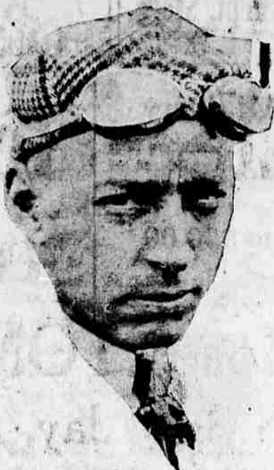
EDDIE HEARNE Who won world's championship in 1923.

A number of the drivers in Sunday's races arrived from Los Angeles today with their speed creations in an express car and are trying out on the Jackson County Fair Grounds speedway, preparatory to the second annual auto speed classic to be held here Sunday, August 15. De Palma, who was here last year, and is here again, and the other drivers pronounce this one of the fastest dirt tracks on the coast and predict