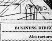
© 1925 BY INTEL FEATURE SERVICE, INC. Great Britain rights reserved.

Summons for Publication In the Circuit Court of the State of Oregon in and for the County of Jackson.