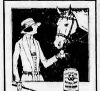
Zest for outdoor sports is imparted by...

Caswell's NATIONAL CREST Coffee delicious and invigorating ORDER BY TELEPHONE 1077 1500,000 cups were served at the PANAMA-PACIFIC International Exposition