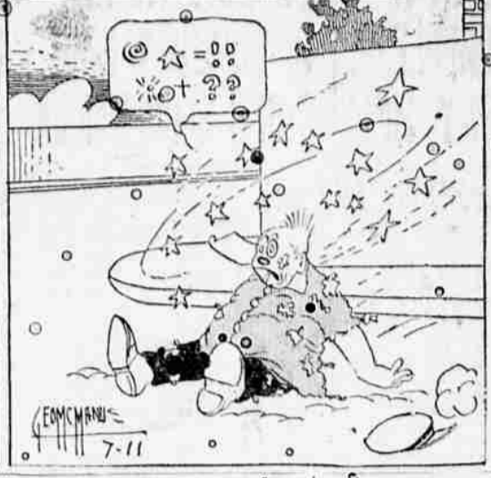
© 1925 BY INT'L FEATURE SERVICE, INC. Great Britain rights reserved