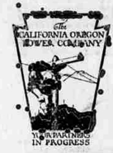
*The actual average cost of current for electric cooking and lighting, together, in homes in this neighborhood, is $5.62 a month.

That's one reason why electric ranges, with their instantly regulated and easily controlled cooking temperatures, from a sizzling, searing heat in one place to a just-keep-it-alive glow in another, are so favored by good cooks. Electricity makes good cookery better, and easier. And that, plus the surprising economy* of electrical cooking, is a reason why nearly one thousand eight hundred kitchens in the territory served by this company are now fuel-less and ash-less. Nearly one thousand eight hundred electric ranges have made them so. Ask your nearest dealer to show you several models. Convenient payments, if you like.