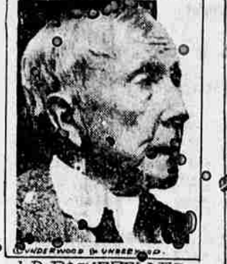
J. D. ROCKEFELLER.

TARRYTOWN, N. Y., July 8.—(A. P.)—John D. Rockefeller will be 86 years old today. His program for celebration of the event includes a round of golf on his private course.