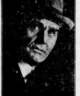
HON. W. M. JARDINE, U. S. Secretary of Agriculture