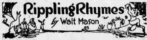
FOUR PER CENT.

Correct this sentence: "She lives in Boston," said the publisher "and the Negro dialect of her stories is very convincing."