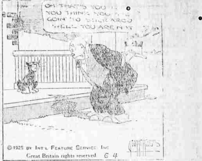
©1925 BY INTL FEATURE SERVICE INC. Great Britain rights reserved G 4