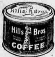
In the original Vacuum Pack which keeps the coffee fresh.