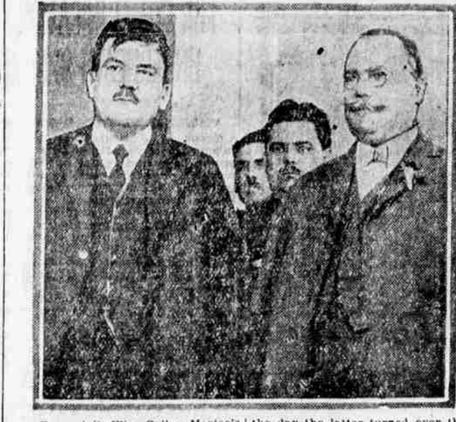
General P. Elias Calles Mexico's | the day the latter turned over the new chief executive, posed for this reins of government of the photograph with General Obregon south of the Rio Grande.

Generals Calles and Obregon, New and Retiring Presidents, in Mexico City on Inauguration Day