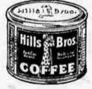
In the Original Vacuum-Pack which keeps the coffee fresh.

MATCHING the West's reputation for whole-souled hospitality is its tradition as the home of "perfectly wonderful coffee." From homes of wealth and nice perception, this tradition has spread until to-day it embraces the whole western empire.