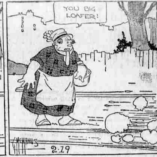
© 1924 BY INT'L FEATURE SERVICE, INC.