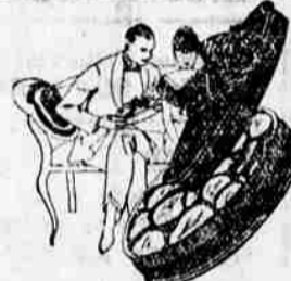
Our line of